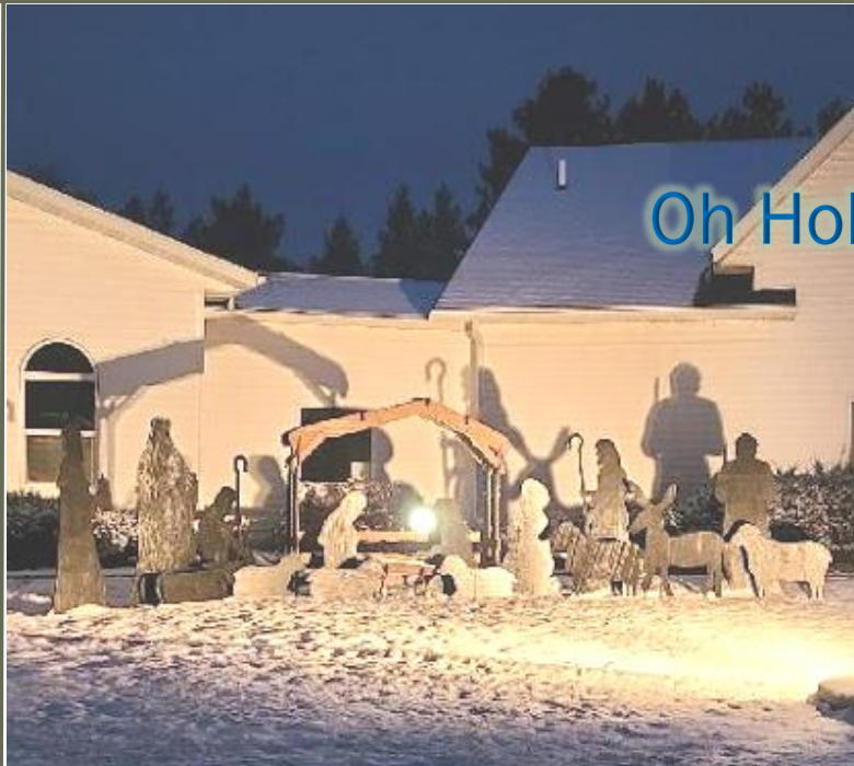
Oh Holy Night